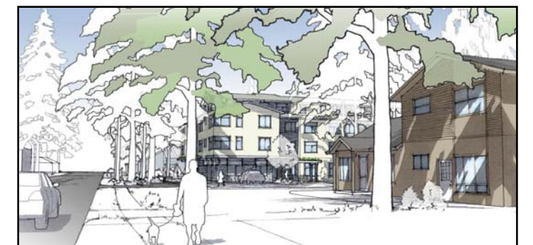
Preliminary sketch of Oakridge Park, Lake Oswego

We have more new projects in the early stages of development, so stay tuned to for details!