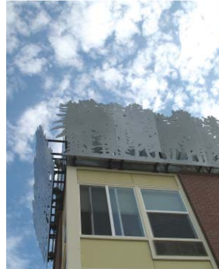
Trenton Terrace in North Portland has 65 affordable apartments with green features for seniors, and provides art for all to enjoy.